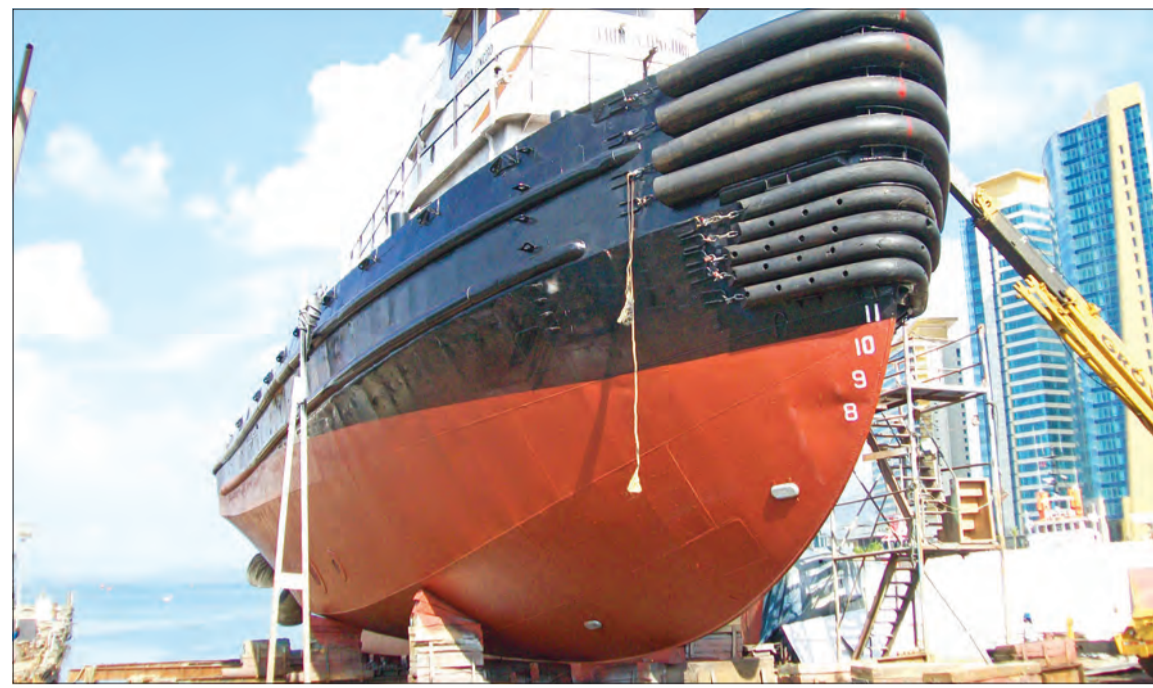
Trinidad and Tobago is breathing new life into its maritime sector with a dry dock facility and transshipment port.

As a result, government officials are exploring the feasibility of establishing a transshipment port, along with a dry docking facility, in the