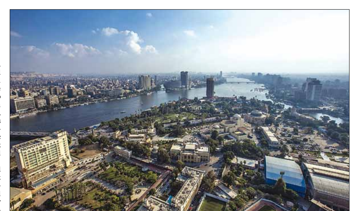
Cairo, the capital of industry and commerce.

"I am convinced that with our joint efforts, the friendship between