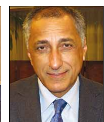
Tarek Amer, governor of the Central

"The authorities succeeded in significantly reducing the underlying budget deficit despite a decline in