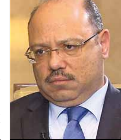
Hany Kadry Dimian, former minister

in the medium term. "The country's return to international markets was marked by the successful issuance of a $1.5-billion Eurobond. Macroeconomic figures also point to some improvement, with growth rebounding to 4.2 percent in 2014-15, and inflation has declined. Financial soundness indicators point to the continued