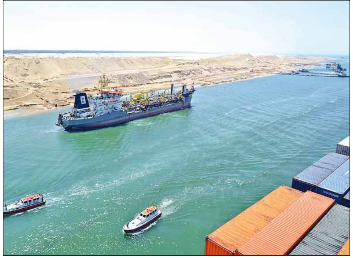
The expansion of the Suez Canal is an engineering feat that will allow more vessels to use the vital waterway.

in further enhancing Sino-Egyptian cooperation. "We are already in contact with some Chinese partners who are particularly related to the transport sector, as in railways," Bishai added. "We also have met with some contractors from the energy