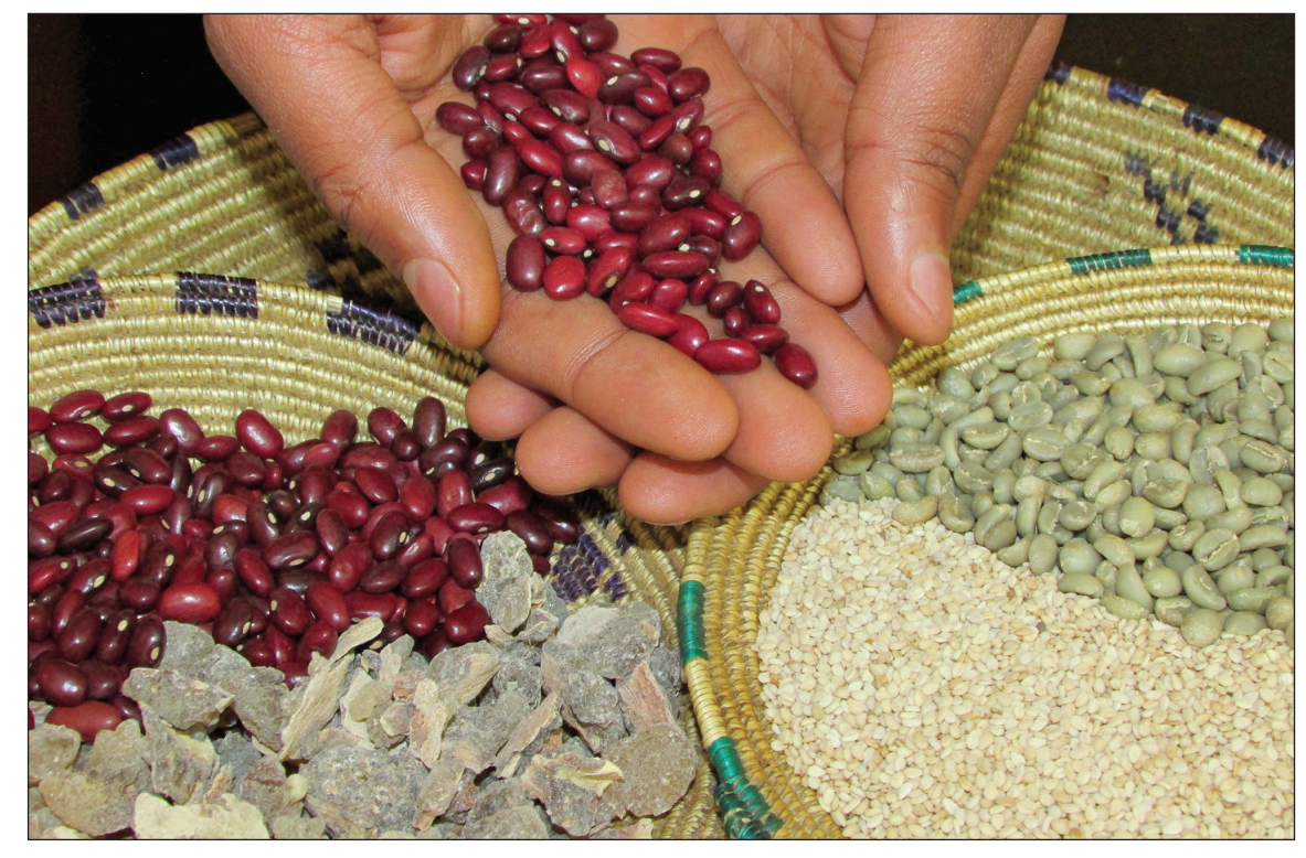
Guna Trading is Ethiopia's leading exporter of gum, coffee, sesame and pulses.

"Foreign investment in Ethiopia is growing very fast," he said. "We have cheap, sustainable energy so we would like to attract energyintensive industries, such as petrochemicals or pharmaceuticals. Last year, we developed a national framework for Special Economic Zone Development and identified