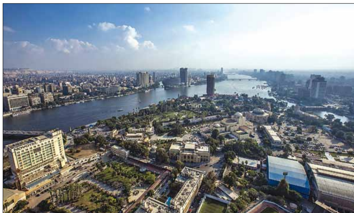
Cairo, the capital of industry and commerce.

"I am convinced that with our joint efforts, the friendship between