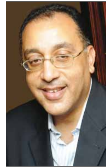
Mostafa Madbouly , minister of housing, utilities and urban communities

“Egypt is extremely eager to establish strong and sustainable relations with Chinese companies – and work with them on several mega projects.”