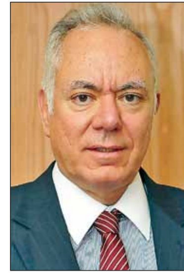
Mounir El Zahid , chairman and CEO of Banque du Caire

investment groups and investment funds also reaping rich rewards.