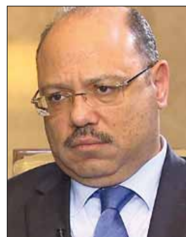
Hany Kadry Dimian, former minister of finance

"The country's return to international markets was marked by the successful issuance of a $1.5-billion Eurobond. Macroeconomic figures also point to some improvement, with growth rebounding to 4.2 percent in 2014-15, and inflation has declined. Financial soundness indicators point to the continued