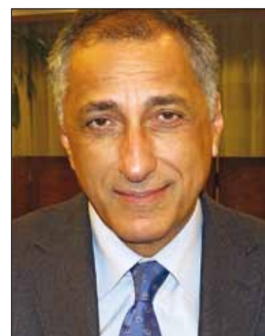
Tarek Amer, governor of the Central Bank