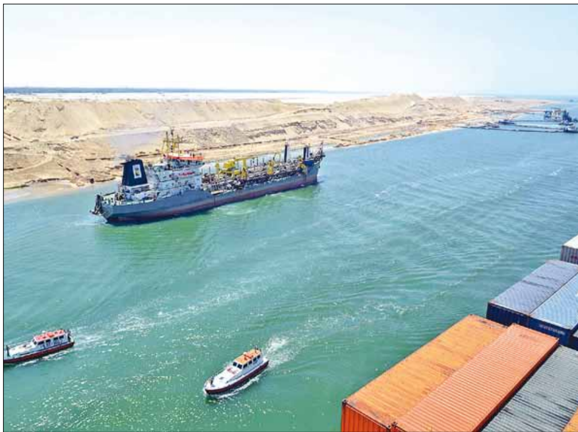
The expansion of the Suez Canal is an engineering feat that will allow more vessels to use the vital waterway.